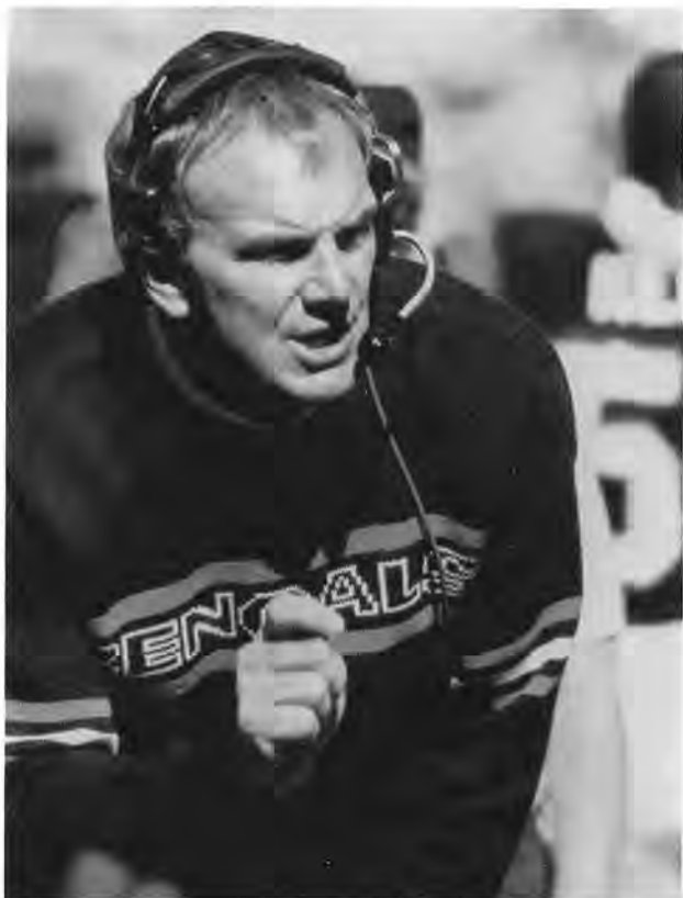
Bengals' coach Sam Wyche